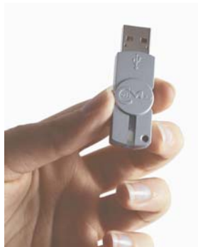
Photo: Mini device CodeMeter-Stick as strong Digital Rights Management solution