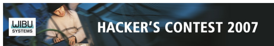
Photo: Picture of Hacker's Contest 2007